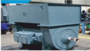
260 KW - 8P - 3.3KV - KEC