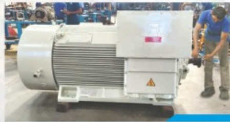
710 KW - 2P - 11KV - SIEMENS