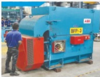
620 KW - 4P - 6.6KV - ABB