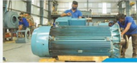
370 KW - 6P - 3.3KV - ABB