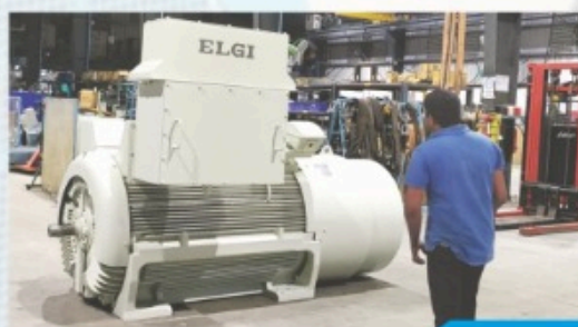
375 KW - 2P - 11KV - ELGI TECO