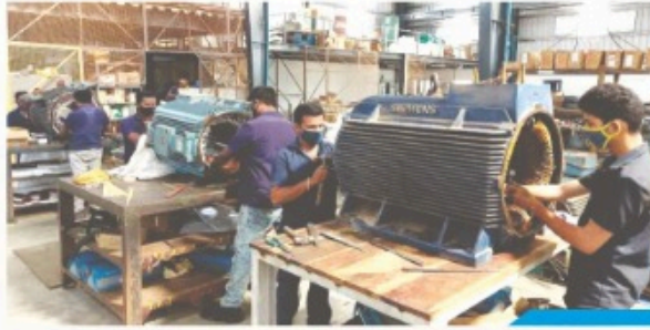
250 KW - 6P - 415V - SIEMENS