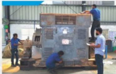
1350 KW - 6P - 6.6KV - BHEL