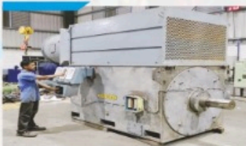
2200 KW - 6P - 6.6KV - CG